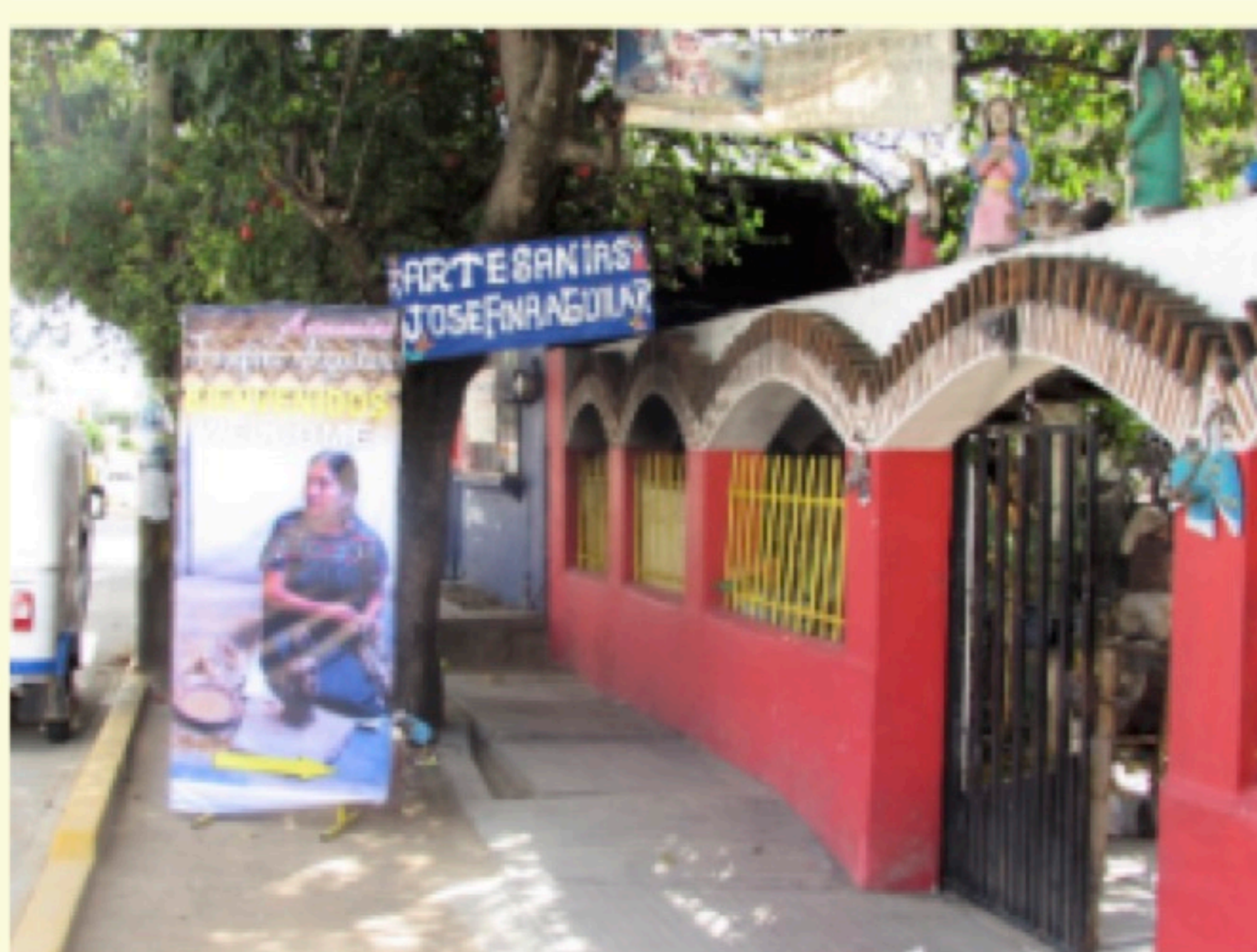
Work Space and Studio