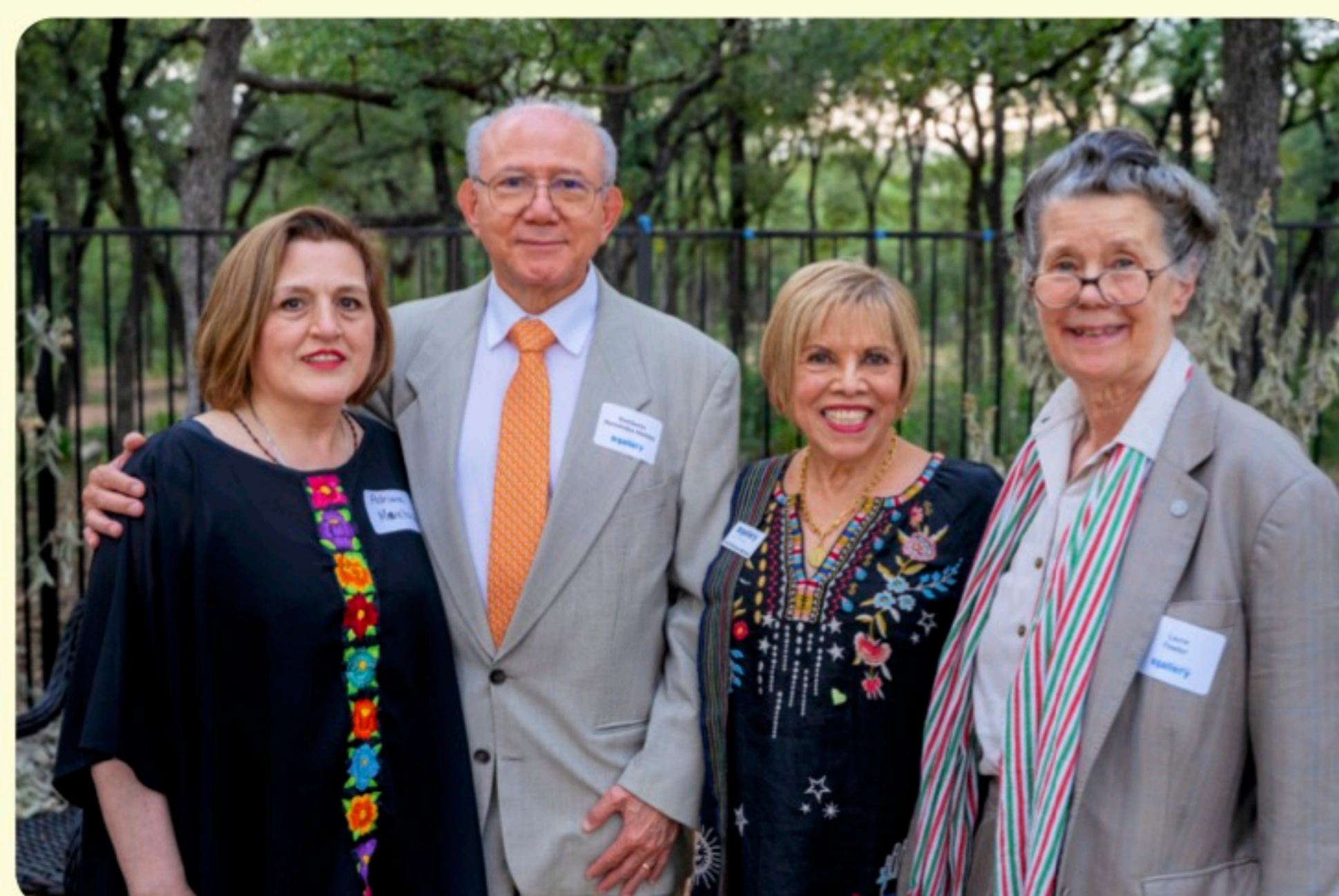
Thanks to our partnership with the Visual Arts League of the JGallery.

Several of our Mexican masks and puppets are featured in the "Somos Uno" exhibition at the Ballard Institute and Museum of Puppetry at the University of Connecticut, which runs through March 2026.