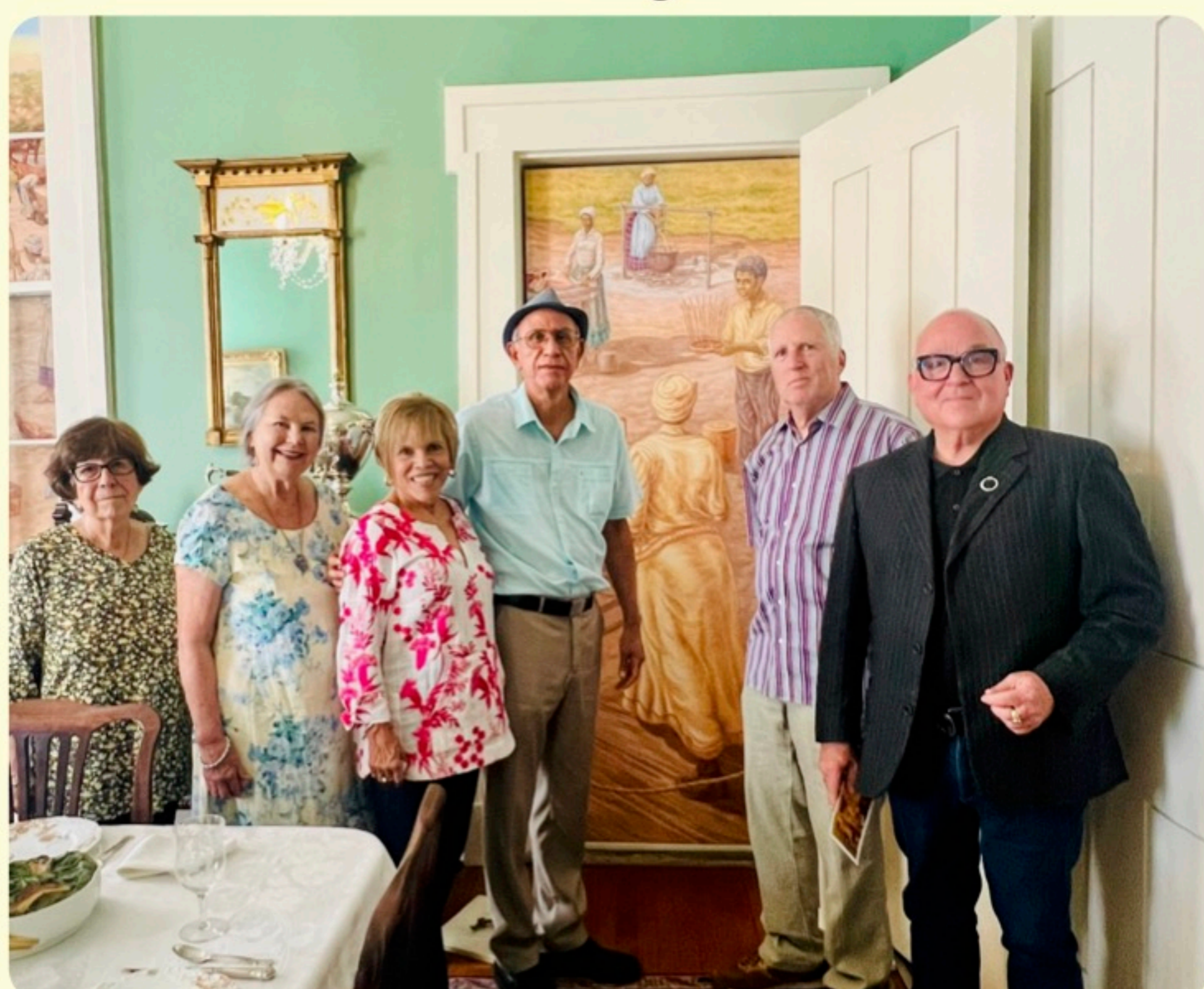
Showcased alebrijes at a park day event in San Antonio