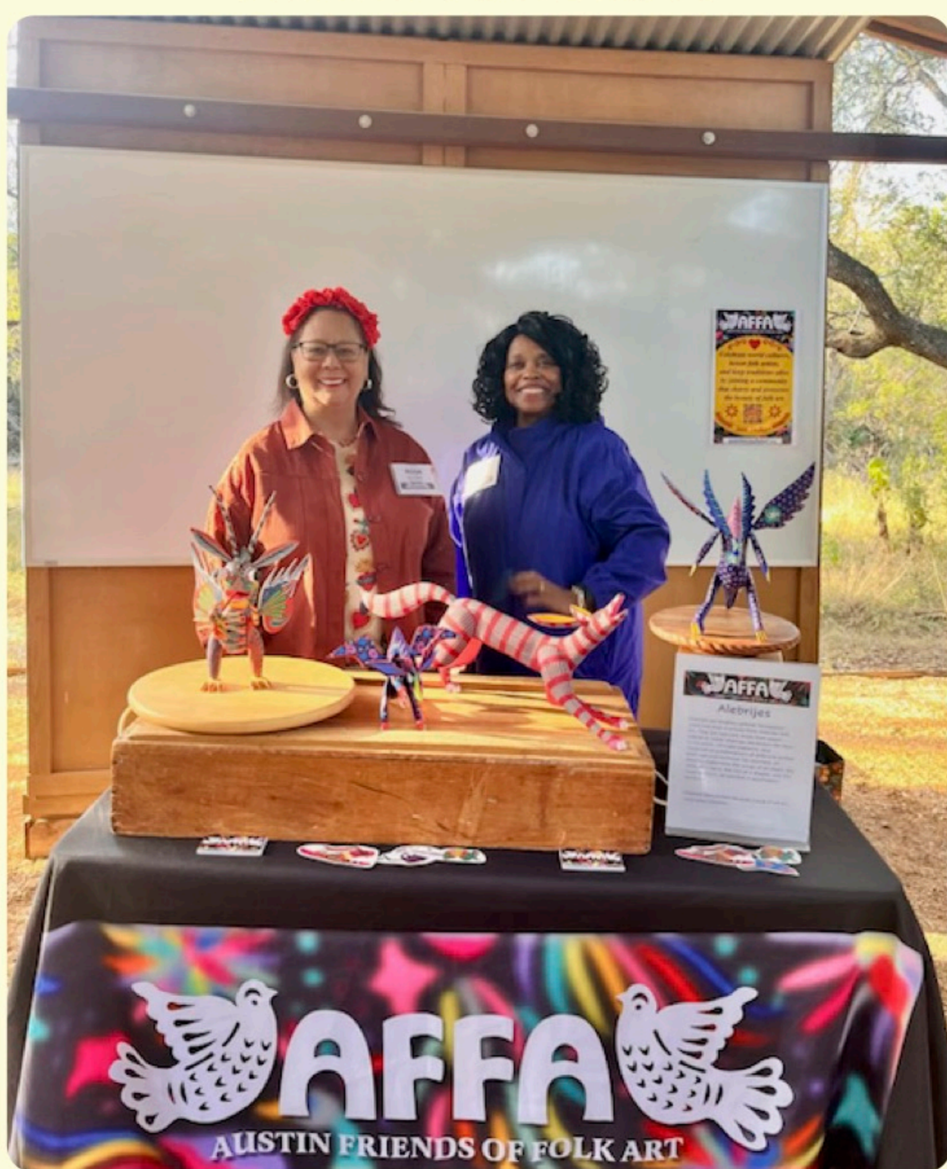
Rotating folk art at IBC Bank