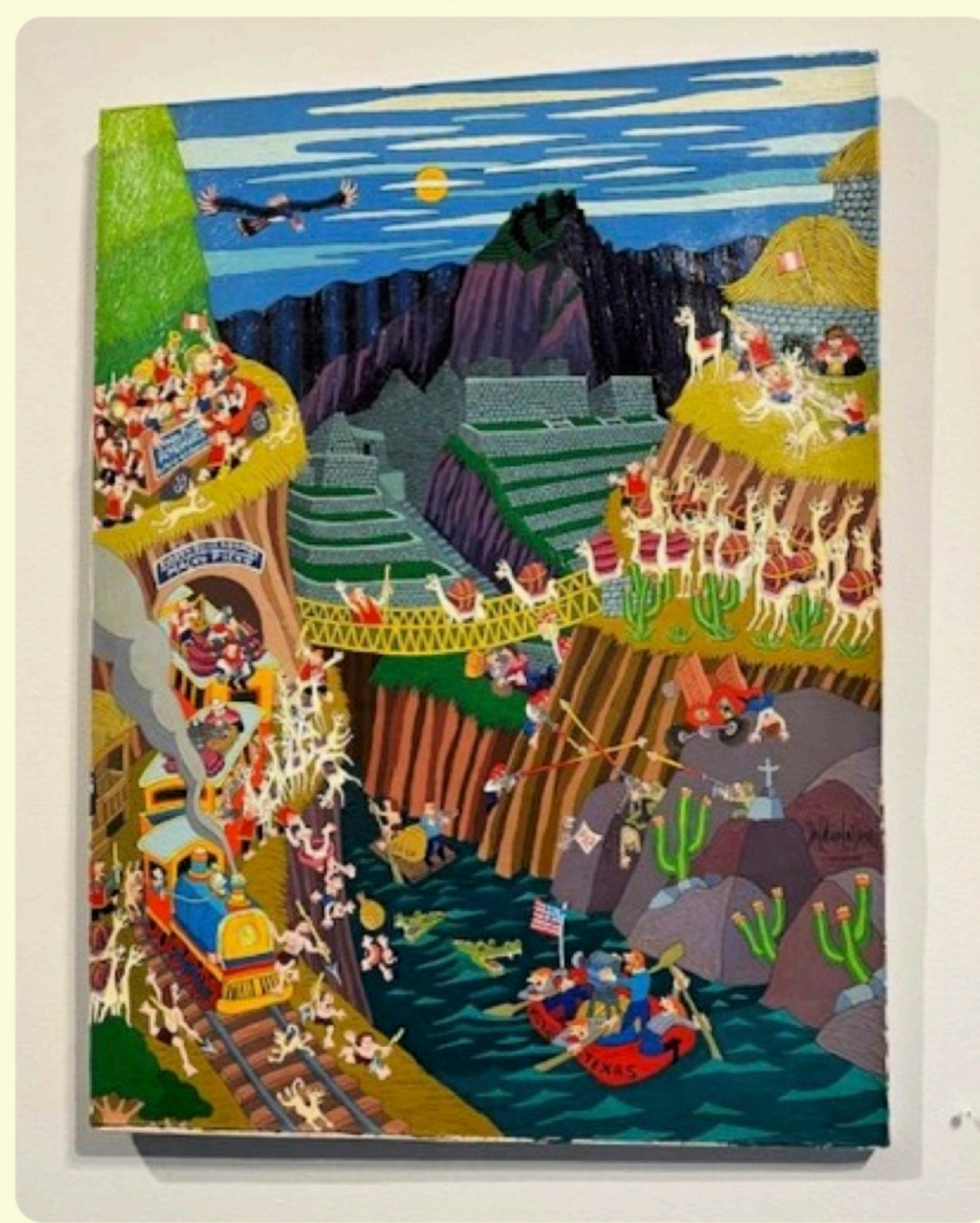
A tour of Tito's Folk Art Gallery

Support for the Peruvian artists exhibit at Link & Pin