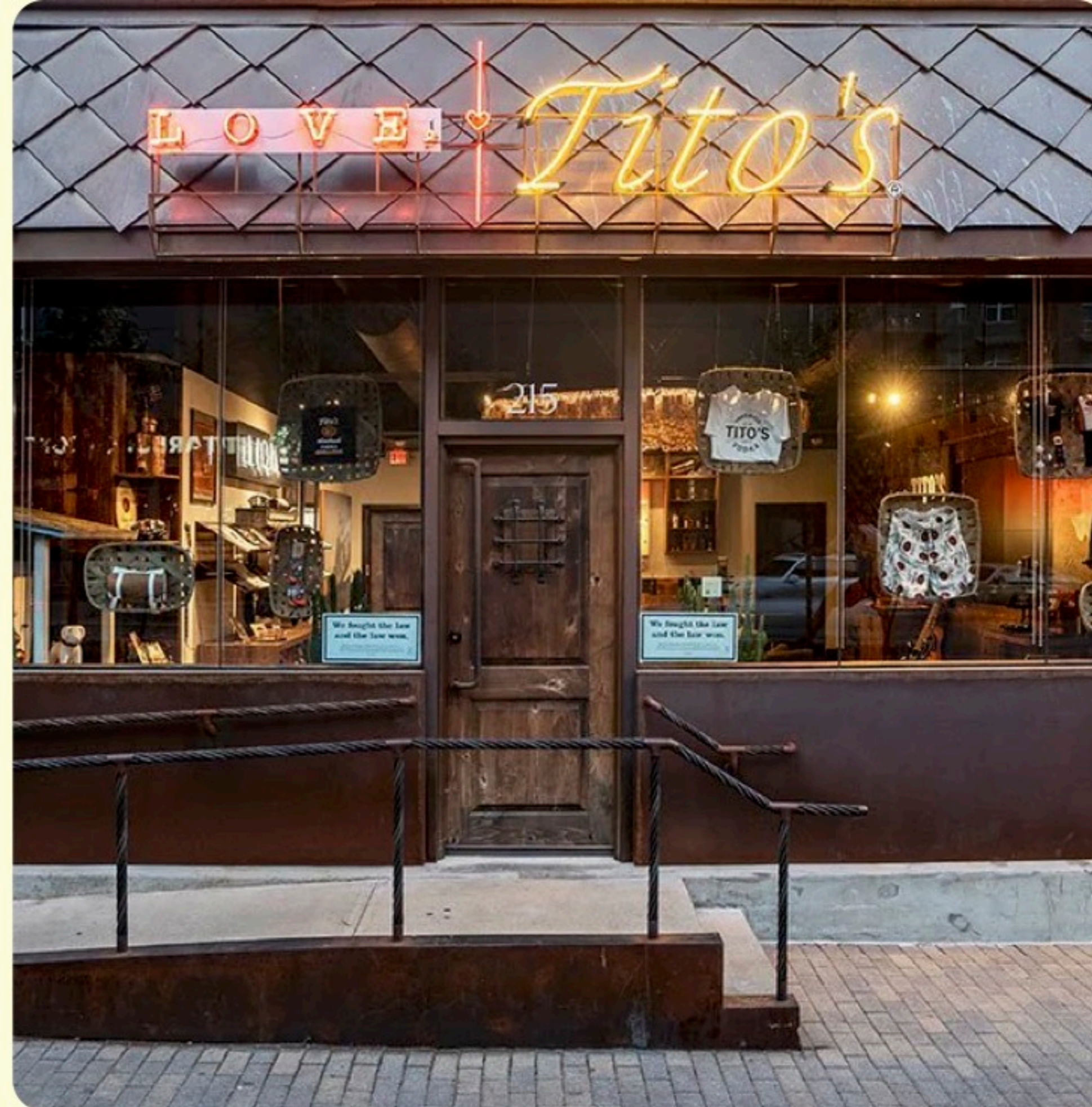
Our main exhibit at the JGallery at the JCC, which closes December 17th