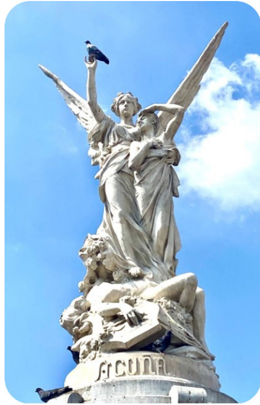
Statue you see in distance in photo to the left