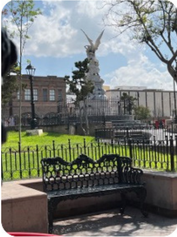
Market Square in Saltillo